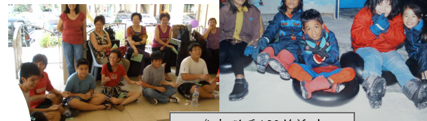
参与联系 123 的活动

实习生将参与一样或多样在三一堂的事工。他们将与牧者和事工同工一起工作, 他们一面观察和经验并帮助在活动和事工, 他们也将得到教导和训练, 亲自参与在教会或外面的讲座和培训。